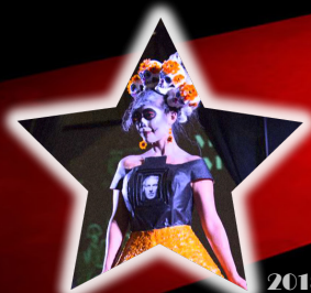
2018 1st place winner

Our 8th Annual Trash Makeover Challenge was fabulous, as designers used famous films as the inspiration for their recycled materials glam. When the house lights came up and the credits rolled, last year's event was our most successful yet! This year, you'll definitely want to save the date for September 14, 2019 when we'll take our 9th iteration of this unique event to the grandiose ballroom of the Texas Federation of Women's Clubs. Visit trashmakeover.com to keep up with the latest. Cheers!